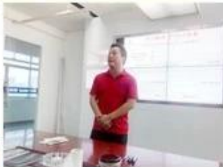
lecturer for Execution

البريد الإلكتروني: overseasales-2@rcmccv.com