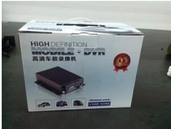
Richmor Brand Package