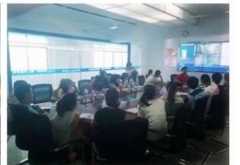
Technical Training For Fast Response to Customer Richmor 锐驰曼