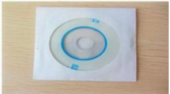
CD ( Manual & Software inside )