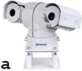
PTZ HD Camera Series