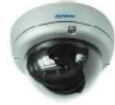
Car Camera Series