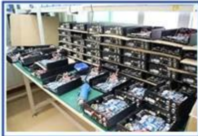
圖 表 說 明 ：

Richmor 公司 2013 年 1 月 1 日 至 2014 年 12 月 31 日 止 的 報 告 期 間 內 所 有 的 報 告 均 經 審 計 師 審 計 並 出 具 審 計 報 告 。