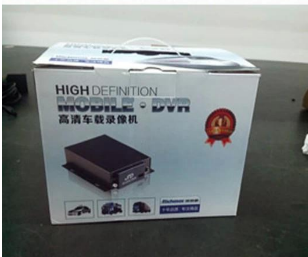
Richmor Brand Package