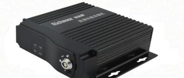
SD Mobile DVR